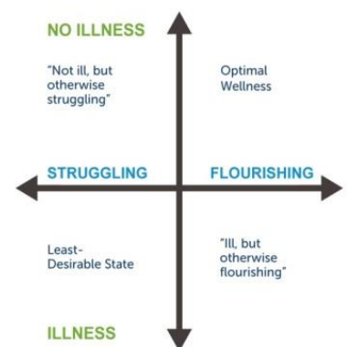
Figure 1. Illness/Flourishing Dimensions

All emotional and mental processes occur in the brain and nervous system, and are further embodied in hormonal, immune, and motor responses.