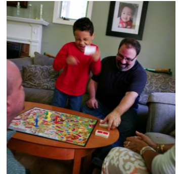
People facing mental health challenges are subject to social exclusion and stigma comparable to that associated with skin color, ethnicity, or sexual orientation.

Unfortunately, misconceptions about mental illness abound, and are perpetuated by the sometimes sensational media treatment of the topic. Thus, when the media focus on a connection between mental illness and disturbing behavior (including serious violence), they reinforce the idea that these are closely tied. In fact, most people with mental health challenges are not violent, and disturbing or criminal behavior cannot always be readily linked to mental illness. 24 Unfortunately, the public is more likely to be swayed by emotionally-charged isolated sensational acts than it is to be persuaded by fact-based probabilities. 25 These skewed perceptions can lead the public to distance themselves from, rather than assist, those in need—particularly children and adolescents. 26