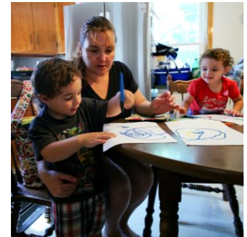
Starting with the newest parents, programs teach expectations for children that are age-appropriate, and parental behaviors that contribute to environments that are safe and supportive.

The Positive Parenting Program (Triple-P), designed for parents of children from birth through adolescence, is an example of a “tiered” approach. Community-wide messaging about positive parenting is delivered via a variety of broadcast, print, and electronic media, in order to change community norms around parenting behaviors, and to reduce the stigma related to seeking help. For parents who have one or more risk factors, Triple-P provides progressively more-targeted services, including large-group workshops, small-group sessions lasting 10-14 weeks, and individual consultation. In addition, training is provided for a variety of community-based care providers who frequently come into contact with children and their families (pediatricians, child care providers, social workers in government and non-profit agencies, school counselors). Rigorous evaluations of the program suggest it can have a positive impact on